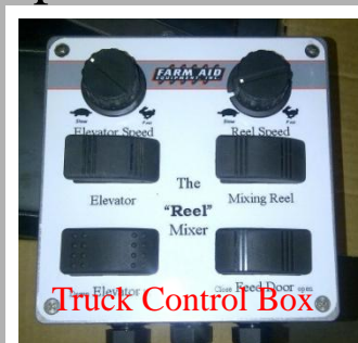
Truck Control Box