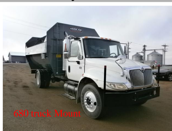
680 truck Mount