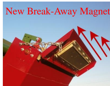
New Break-Away Magnet