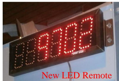
New LED Remote