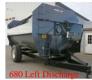
680 Left Discharge